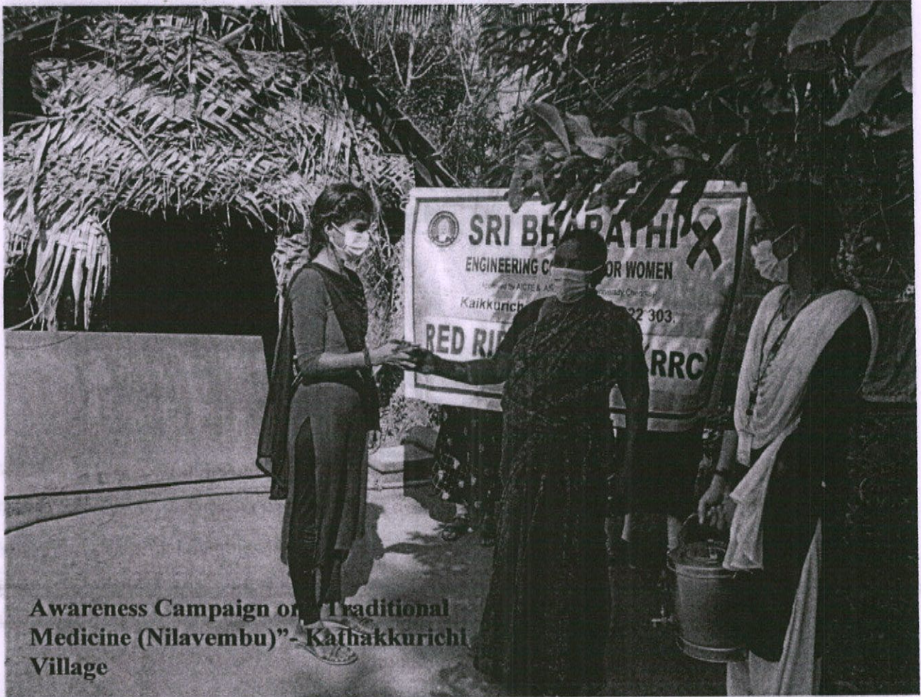
Awareness Campaign on "Traditional Medicine (Nilavembu)" - Kadhakkurichi Village

PRINCIPAL SRI BHARATHI ENGINEERING COLLEGE FOR WOMEN KAIKKURICHI - 622 303, PUDUKKOTTAI DISTRICT